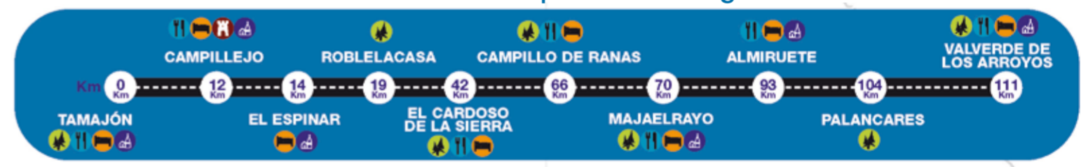
Route of "La Campiña"